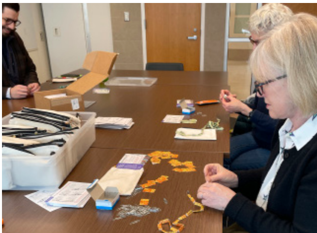
Members of the Art & Design Committee work on Words of Our Hearts.