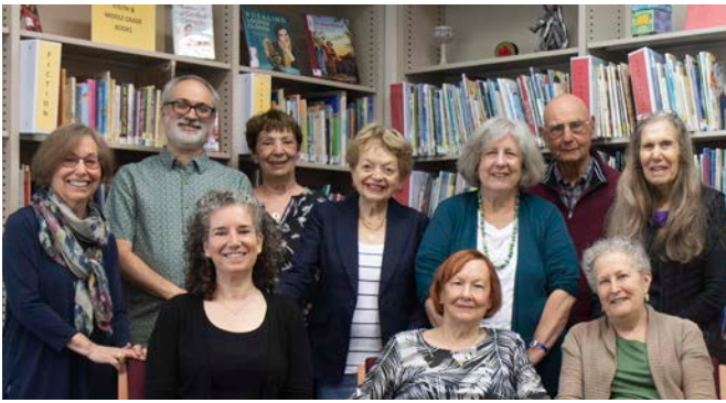
Members of the Library Committee.

Unlock the world of Jewish literature. It's now easier than ever to access Temple Sinai Library's resources.