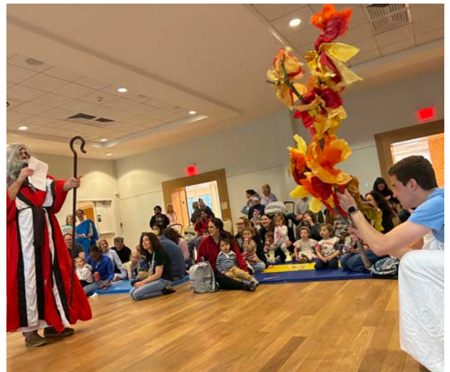
Top: assembling art bags for preschool and toddler students at Briya Public Charter School. Bottom: Parent volunteers as Moses and the burning bush at the TSNS Passover celebration.