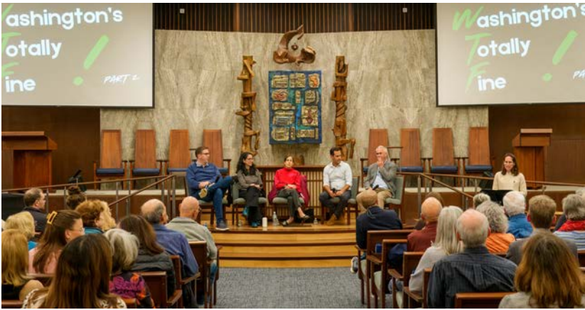
The WTF: Washington's Totally Fine panel in October 2025, which was followed by time to deepen our connections over pizza and beer.