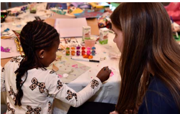
Top to bottom: Families taking off for the 2025 Fun Run before the 5K, shopping for and creating gifts at the annual holiday party.

Two of our in-residency mothers recently graduated from college, one earning a nursing degree and the other completing a bachelor's degree in public health. One of these graduates secured a position as a NICU nurse at Children's National Hospital. Another recent graduate has been accepted into a Master's in Public Health program. One of our alumnae mothers recently secured a supervisor position with DC's Department of Motor Vehicles. We also have our first Ph.D. candidate studying at the Virginia University of Integrative Medicine.