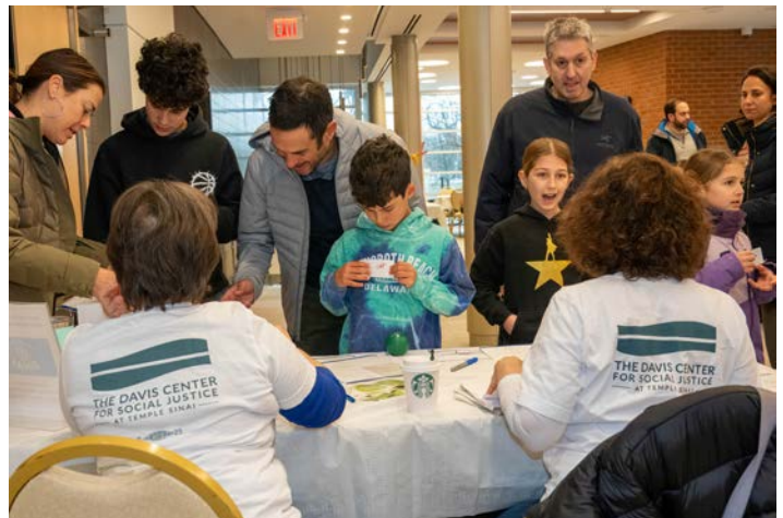
Top: Teens volunteering at the DC Diaper Bank. Bottom: Checking in for the MLK Mitzvah Day.