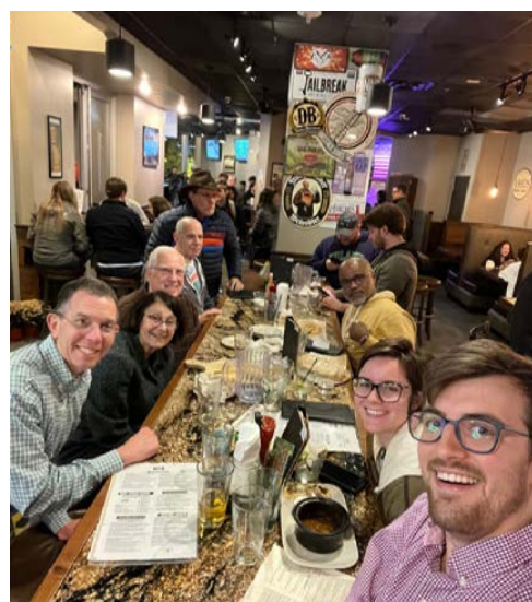
Top: Tending the Adult Purim bar. Bottom: The 50 Shades of Gray Hair trivia team.